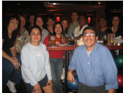
The HCP IT team—having fun!

cific Ocean to the San Gabriel mountains. From the City to the Valley you can find a HCP provider to meet your needs.